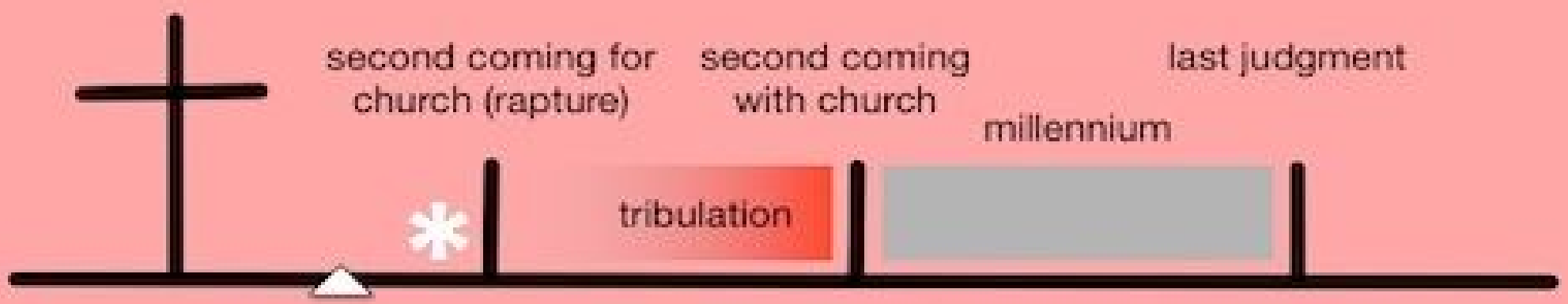
Pre-tribulational (dispensational) Premillennialism