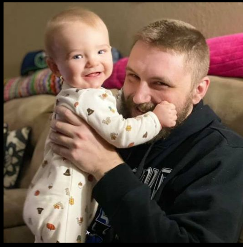
Daddy's little dude